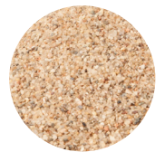
#2 ANTI-SLIP 0.7-0.2µm