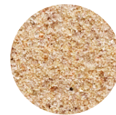
#0 ANTI-SLIP 0.4-0.8µm