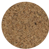
HST60 125 – 355µm