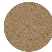
RH110 100 – 300µm